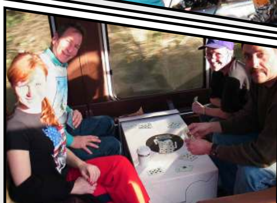
What happens on the train