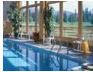
Grouse Mt. Resort pool

"The club that really skis" PO Box 2182, Portland, OR 97208