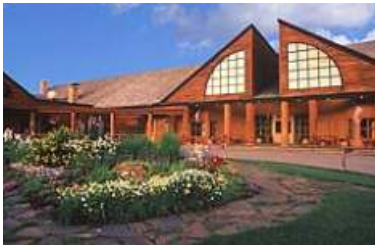
Grouse Mt. Resort