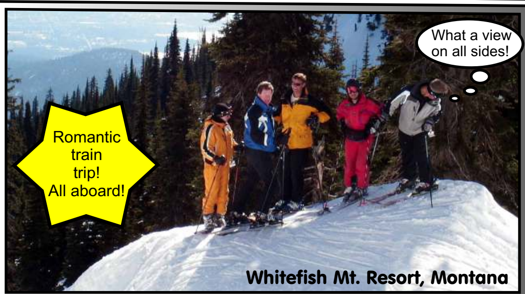
What a view on all sides!