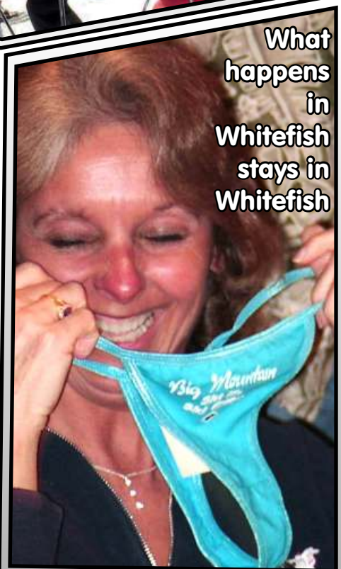
What happens in Whitefish stays in Whitefish