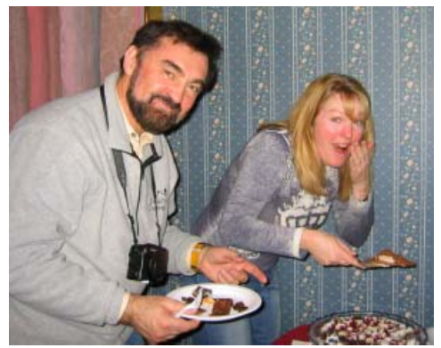
Judges finally agree!