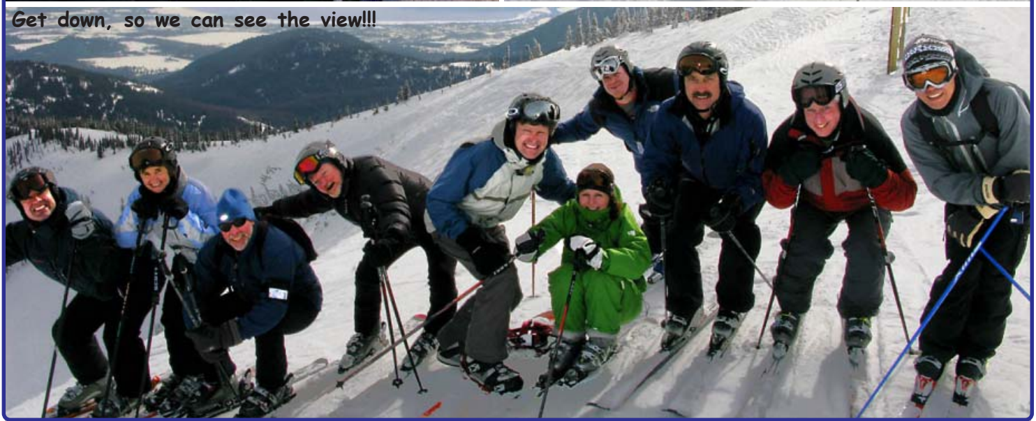
See more photos at www.mthigh.org/PhotosRecent.htm.