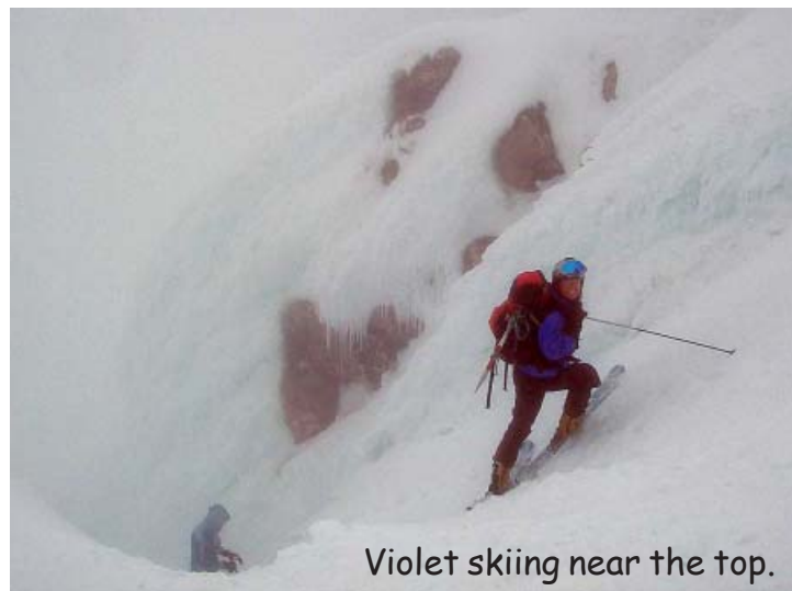
Violet skiing near the top.

Anyone wanting a great summer ski can climb up to Crater Rock at 9800" (or all the way to the Hogsback if you wear crampons) and ski beautiful, wide, rolling pitches of excellent smooth corn snow heading west.