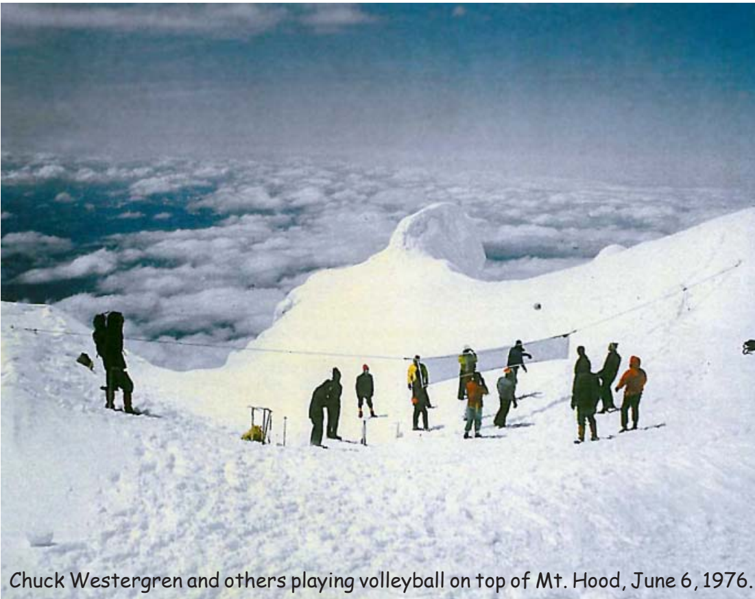
Chuck Westergren and others playing volleyball on top of Mt. Hood, June 6, 1976.

“On the way down, it would have nice to have skis, however we used plastic to sit on for our ride down.”