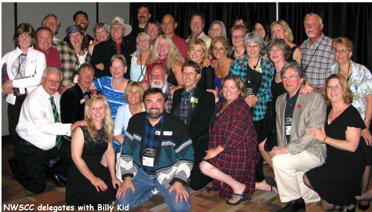
NWSCC delegates with Billy Kidd