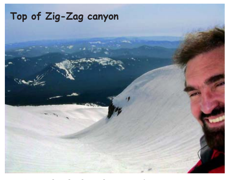
Here's another look at the start of Zig Zag Canyon.

It's perfectly safe if you know what you doing and if you turn back soon enough. Last Sunday, I spent most of the day in that area, taking about 9 or 10 runs there. It's not often that the snow is so good and skiable. So, if you encounter good snow, try it, if you wish.