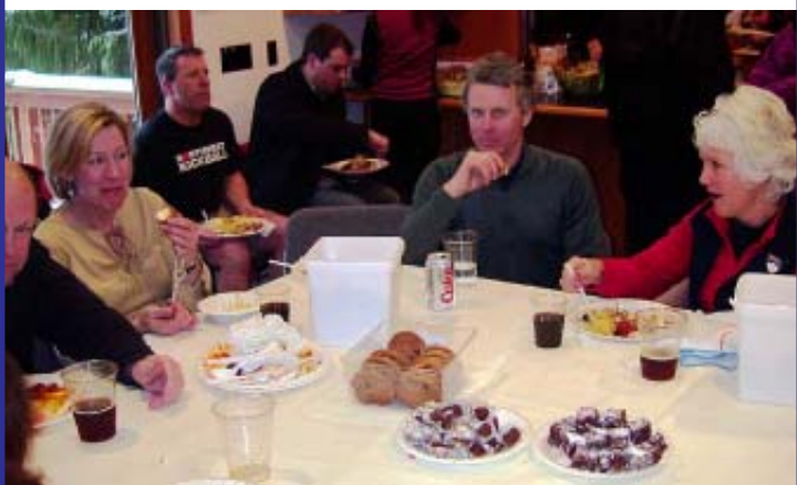
Several people brought delicious desserts!