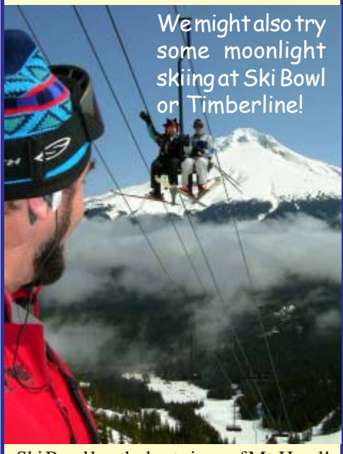
Ski Bowl has the best views of Mt. Hood! And great powder in the upper bowl!

We need to have a head-count ASAP. So, please send in your $17 and contact Emilio, 1-503-378-0171 or info@mthigh.org.