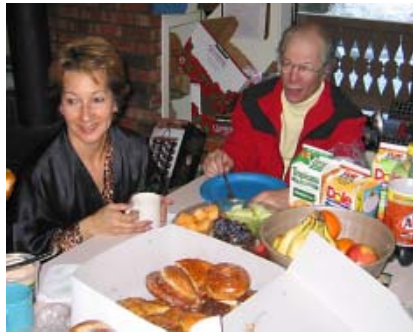
We enjoyed good food!