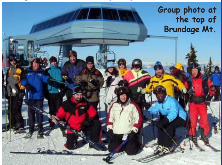
Group photo at the top of Brundage Mt.

More photos at www.mthigh.org/PhotosRecent.htm .