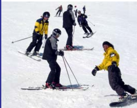
We skied (Human slalom)