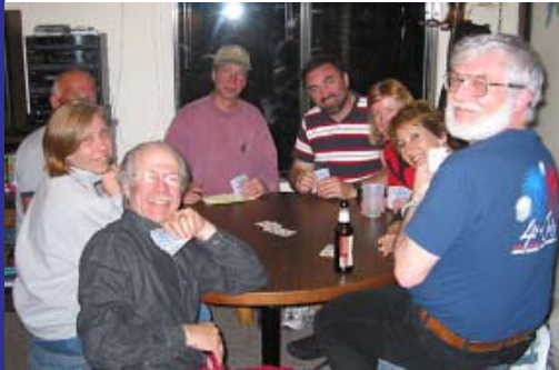
We played cards (Eskimo Whist)

Here are some scenes from a Spring Fling 2 years ago.