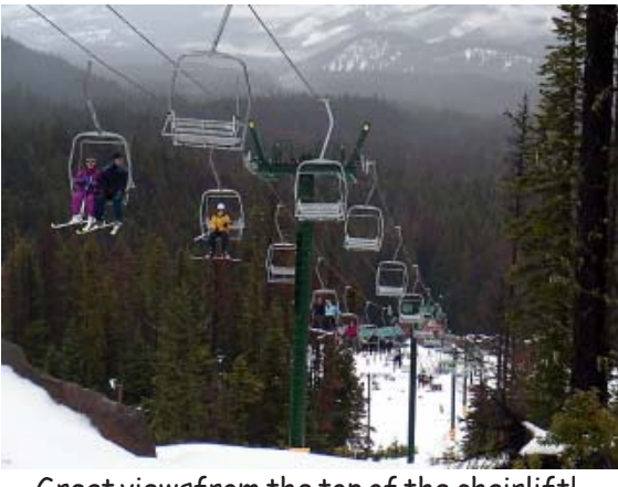
Great views from the top of the chair lift!