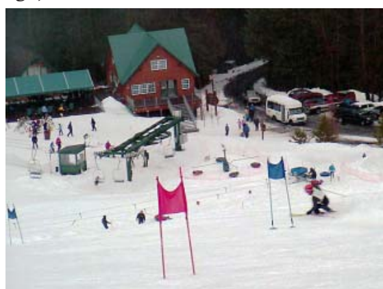
Racer on course, day lodge, & shuttle bus.