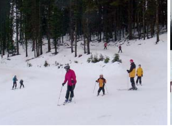
Easy tree trail opens onto a meadow.