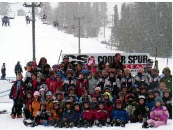
Group photo of the young racers.