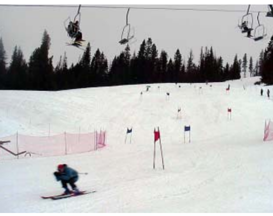
Racer arriving at the finish line.