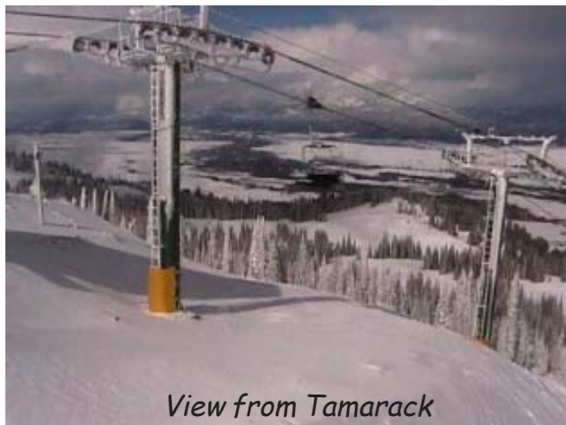
View from Tamarack

My skiing experience was delightful in the variety and layout of the runs. I skied on some green, mostly blue, and some black runs; all with adequate snow coverage. In some cases, the trails were hard to follow, because the trees were so sparse. You ski into an open area and there may be three trails converging with different designations,