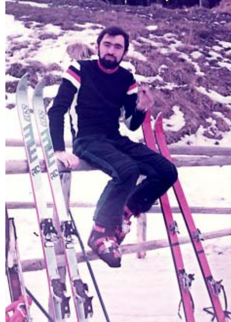
Remember when we skied in sweaters?