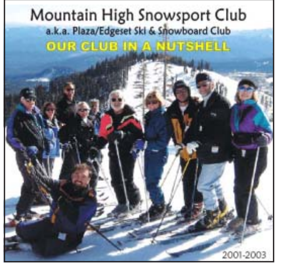
Get a CD containing a PowerPoint slide presentation with several hundred photos of our club (including trips, parties, PACRAT racing, and humor). Show it to all your friends. Only $3. Contact Emilio.

Please help us minimize the cost and labor involved in mailing out paper copies. Let me know if you have an email address Call Emilio at 1-503-378-0171 or email: Emilio2000@Earthlink.net .