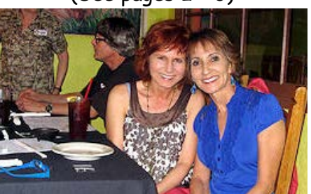
(See page 6)