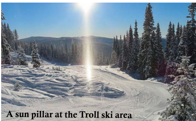
A sun pillar at the Troll ski area

As we grow older, at some point we realize that our time is limited. There are only so many winters left, and our energy will gradually dwindle. So, we should plan where we want to spend the rest of our lives skiing.