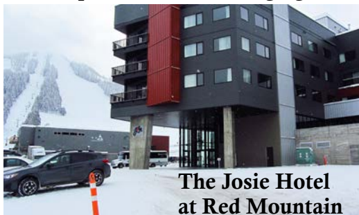
The Josie Hotel at Red Mountain