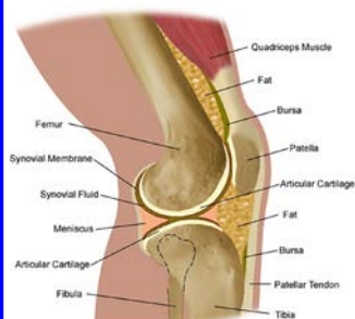
Anatomy of the Knee

Why wait until your knees start hurting or you need surgery? Why not nurture your knees now as a prevention? See several ideas and treatments you can apply now in a 10-page booklet. It covers everything from knee braces to total knee replacement. It's free on our website: http://www.mthigh.org/Articles/Knee-Treatments.pdf .