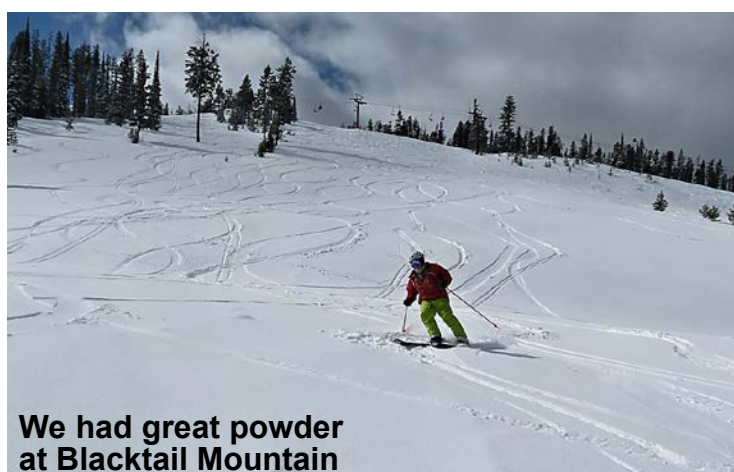
We had great powder at Blacktail Mountain