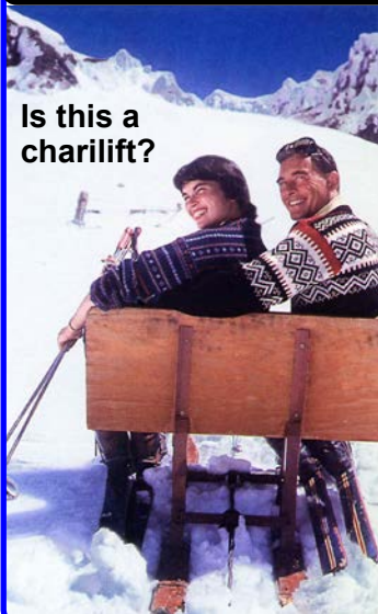
Is this a charlift?