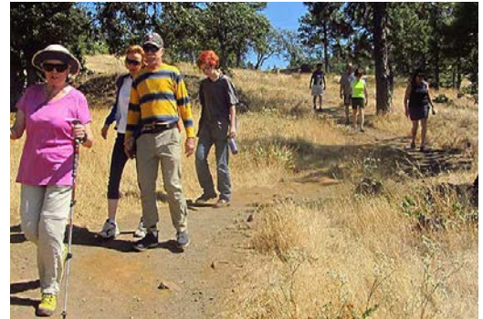
A short hike in Mosier after biking.

Stay fit during the summer. Join us on some of the upcoming hikes and/or bike rides.