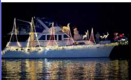
Christmas Ships social - Dec. 12