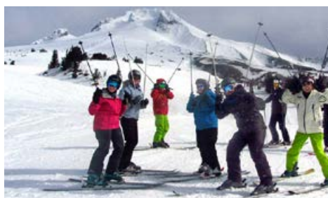
Skiing - when the snow is good