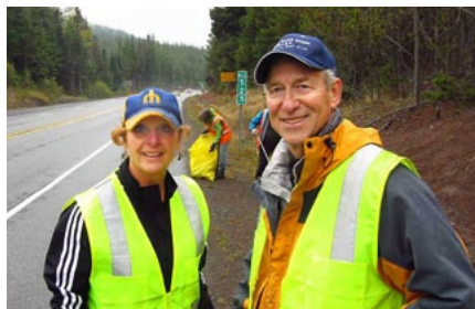
Highway Cleanup (Oct. 20)