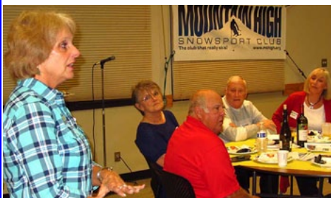
Seafood Party (Oct. 13)