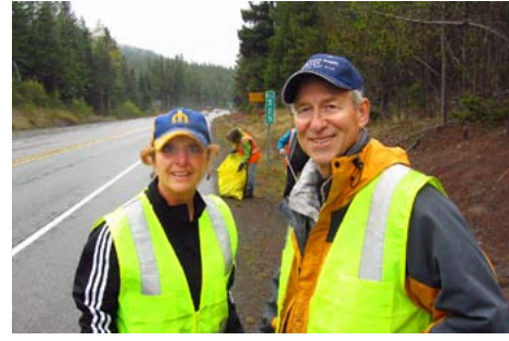
Oct. 15: Mt. High Highway cleanup