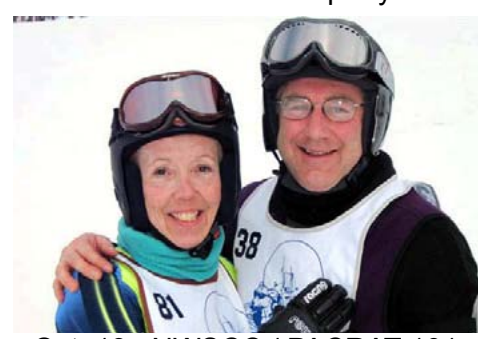
Oct. 13: NWSCC / PACRAT 101