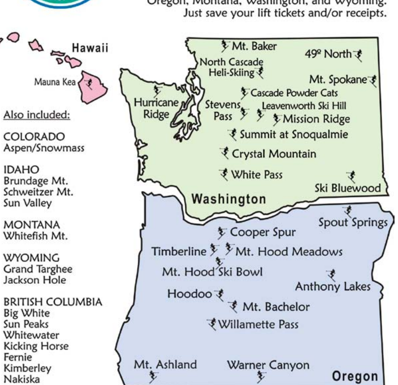
Entry Form and Rules are posted on the NWSCC website at www.nwskiers.org

Qualify for a prize: ski or snowboard in a single season at least 7 ski areas shown here: in British Columbia, Colorado, Hawaii, Idaho, Oregon, Montana, Washington, and Wyoming.