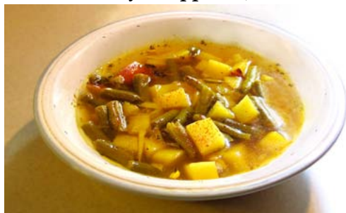
Potato & Green bean soup

Also, just the fact that you are a club member is sufficient connection to the club. But if your recipe has some additional connection to the club, let us know.