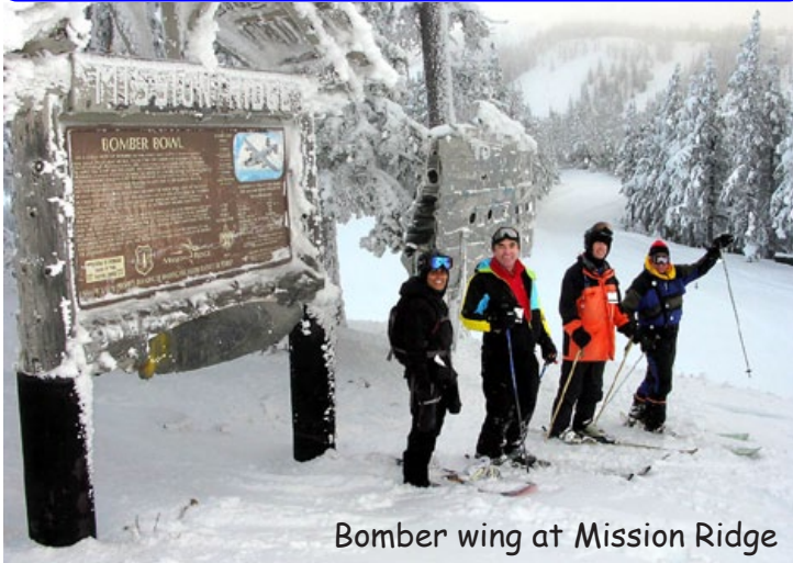
Bomber wing at Mission Ridge

March 21 - 23, 2014. Bus trip. We'll leave Portland on Friday at 4 pm and return Sunday by about 9:30 pm.