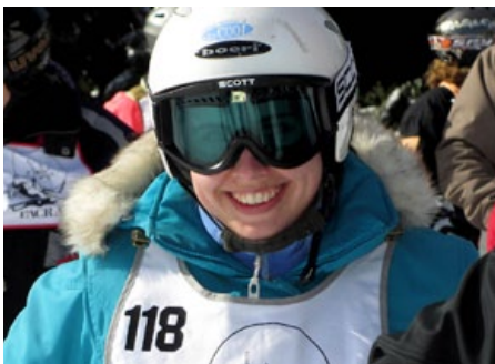
Join a PACRAT team!