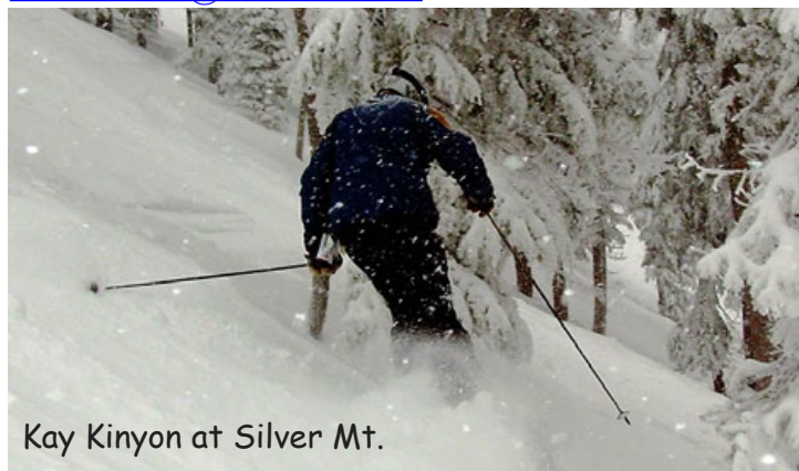
Kay Kinyon at Silver Mt.

Details on our web site. Contact: Emilio , 503-378-0171, Emilio2000@earthlink.net