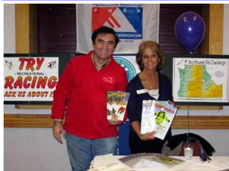
Ski Fair (Nov. 18)