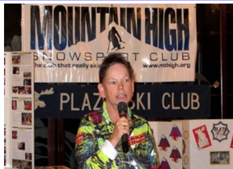
Mt. High Kickoff Party (Nov. 20)