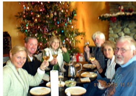
Wine Tour (Nov. 30)