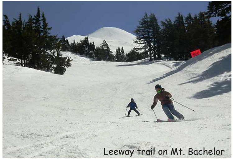
Leeway trail on Mt. Bachelor