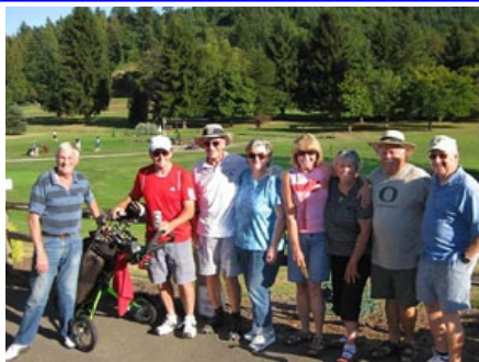
Golf (August 23)