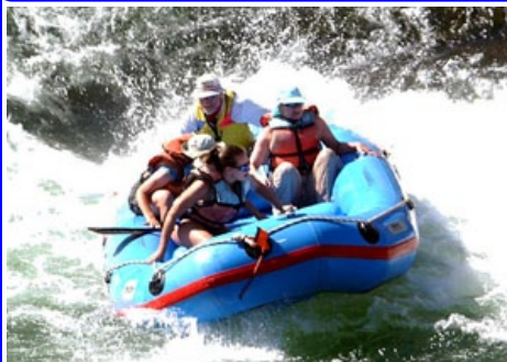
Rafting, (Aug. 15-18)