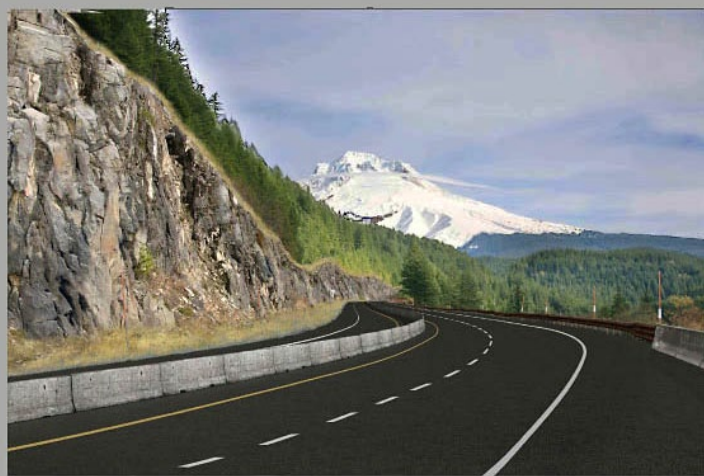
Map Curve (Eastbound) Simulation- Proposed Condition

For more detailed about the project, including simulated before and after pictures, see: http://www.us26mthood-safetyopenhouse.org/