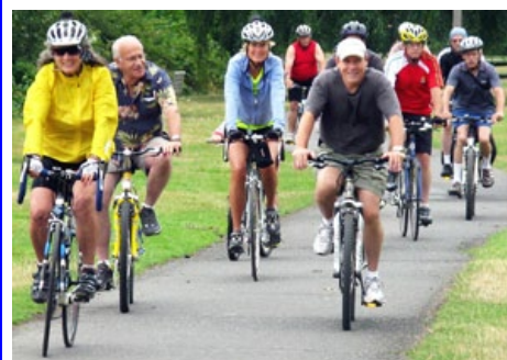
Picnic & bike ride (August 24)