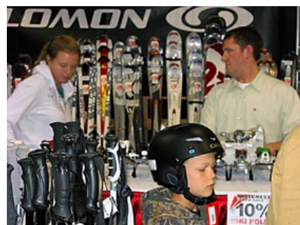
Ski Swaps (Oct. 4, 5, and 12)