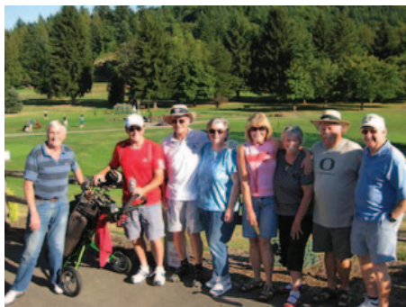
Golf (August 2)