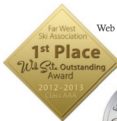
Web site award

As our club grows further, we are now just 2 people short of the next category: AAAA (over 325 members). We currently have 323 members.