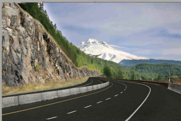
Map Curve (Eastbound) Simulation- Proposed Condition

Notice the rock cut back by a few feet and the new barrier.