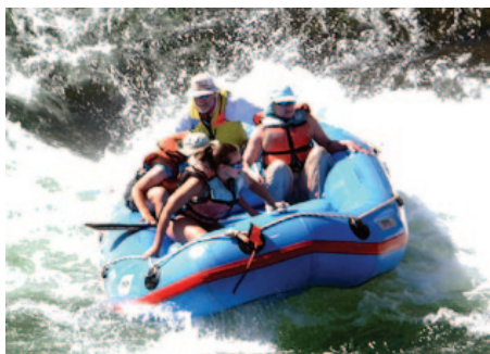
Rafting, Aug. 15-18