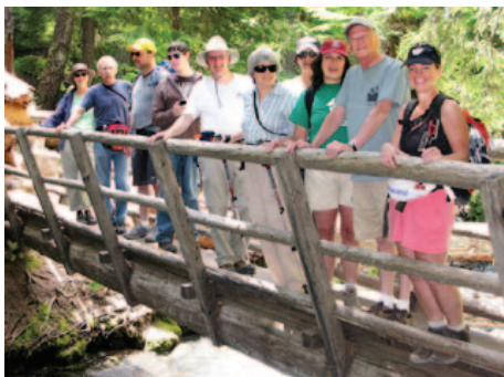
Hiking (1st weekend each month)