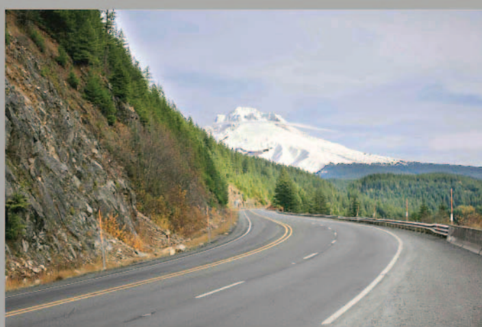
Map Curve (Eastbound) - Existing Condition

For more detailed about the project, including simulated before and after pictures, see: http://www.us26mthood-safetyopenhouse.org/