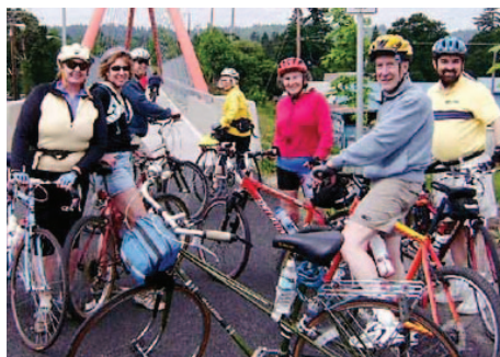
Biking, in July and August