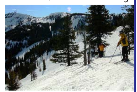
Leavenworth trip: Jan. 27-30