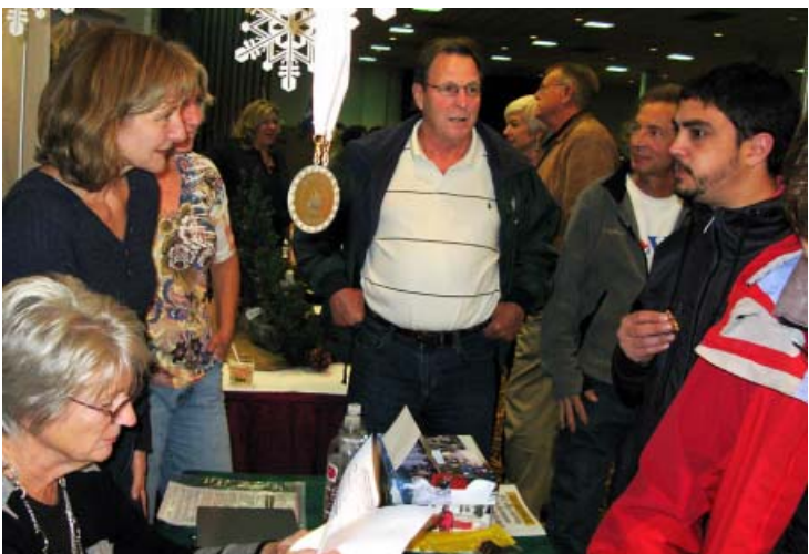
See more photos at <a href="https://www.mthigh.org/Photos.htm">www.mthigh.org/Photos.htm</a>.