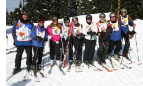
PACRAT / NASTAR Racina