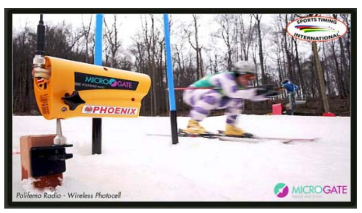
Note the antenna on top of the finish line sensor. There are no wires. The whole system fits into two suitcases.