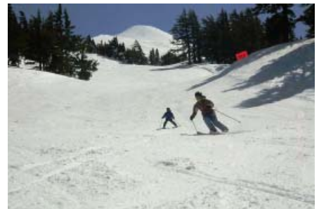
Mt. Bachelor: Jan. 8-10 (p. 8)