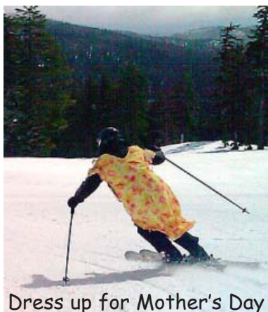
Dress up for Mother's Day