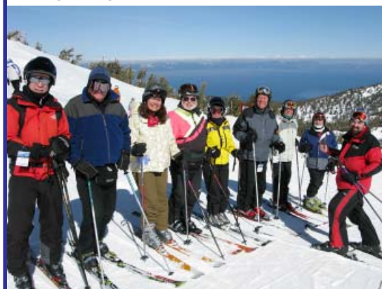
Mt. High members at Heavenly

Come join us for fun on the sunny, snowy Lake Tahoe trip. Heavenly was rated tops for tree skiing in this year's Skiing magazine.