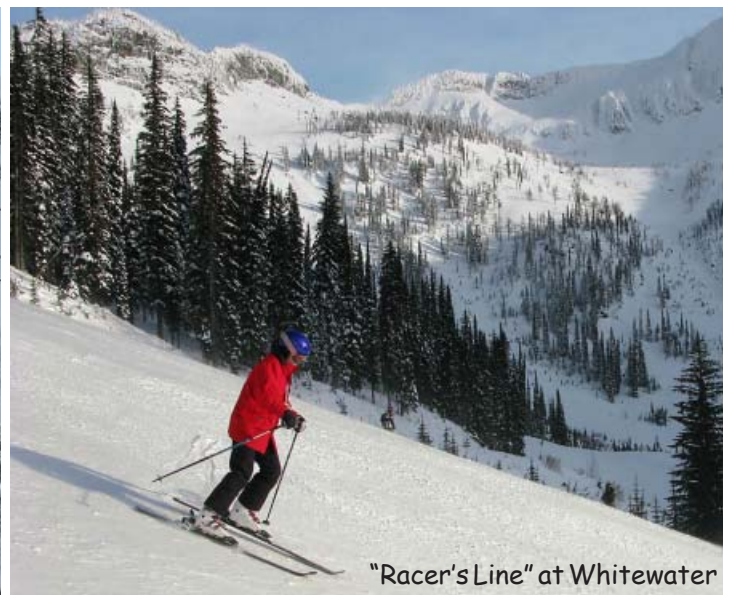
"Racer's Line" at Whitewater

See more photos at www.mthigh.org/PhotosRecent.htm .