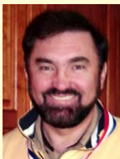
Lucciano Pavarotti Famous tenor.