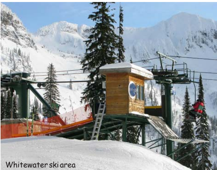
Whitewater ski area

The snow quality was excellent in the trees. All soft and powdery. One of the two hills at Whitewater is in the sun almost all day. The more advanced and larger hill is north-facing and in the shade all day.