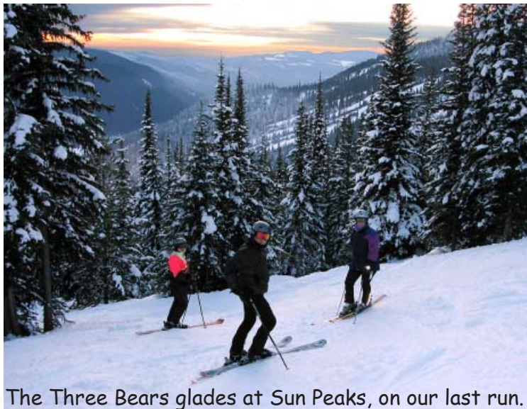
The Three Bears glades at Sun Peaks, on our last run.