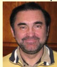
Alberto Tomba (Tomba "La Bomba")