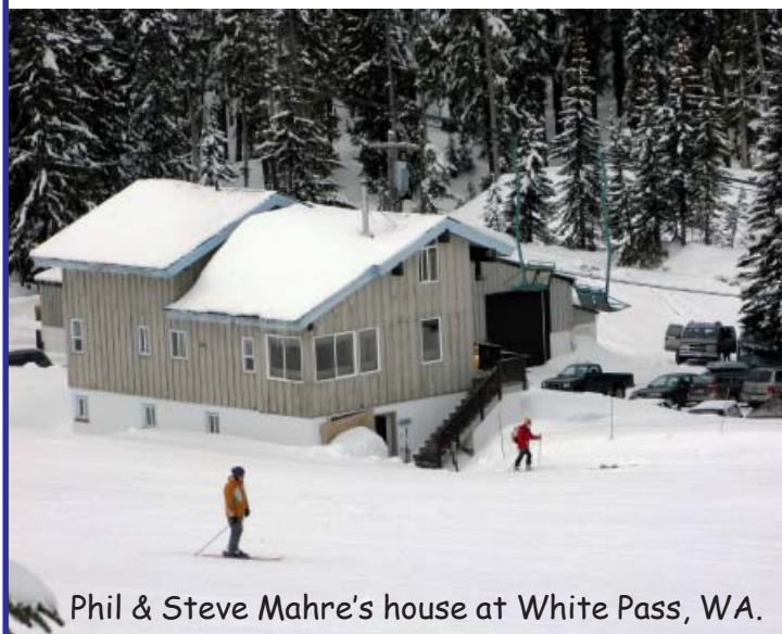
Phil &amp; Steve Mahre's house at White Pass, WA.