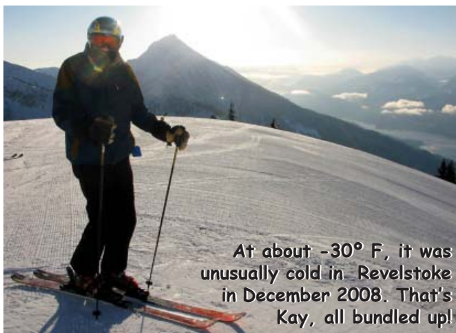
At about -30° F, it was unusually cold in Revelstoke in December 2008. That's Kay, all bundled up!

DAY 1: (Wed.): Ski Mission Ridge Then 5 - 6 hr. drive to Big White.