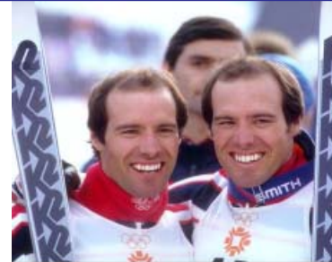
Phil and Steve Mahre, Olympic Gold and Silver medalists.