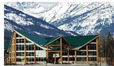
Stanford Resort at Fernie

Lodging: 4 nights at the Fernie Stanford Resort, an off-mountain lodge with a shuttle to the ski area, hot tub, heated pool, restaurant. Full breakfast included. We'll also spend a night in Kellogg, Idaho on the way up, and a night in Ritzville, WA on the way back.