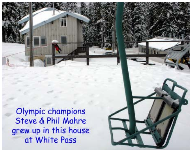
Olympic champions Steve &amp; Phil Mahre grew up in this house at White Pass