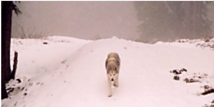
"Bummer! There's no snow left on Pucci. That means Little Red Ridinghood isn't coming back any time soon!"