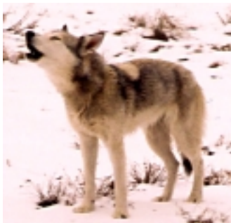
"Somebody feed me!"

Here are several photos Chuck and I took, almost all of them in the area between the Day Lodge and Bruno's chairlift (formerly Betsy). The encounter was exciting. The wolf/coyote was a wild creature. It was not meancing. It seemed it was hoping to get some food. But it wasn't begging. It followed us only to within a few feet of the parking lot, but did not venture onto the asphalt.