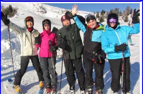
Jan. 19 - 22, 2017

A fun 3-day weekend (by bus) to somewhere fun and mysterious.