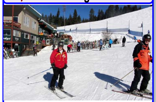
Jan. 12 - 16, 2017

The Skiyente club organizes this 5-day trip to McCall, Idaho, with skiing at Brundage Mt.