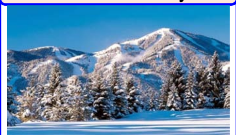
Jan. 29 - Feb. 4, 2017

The Cascade Prime Timers are organizing this trip to Sun Valley for the duration of the week.