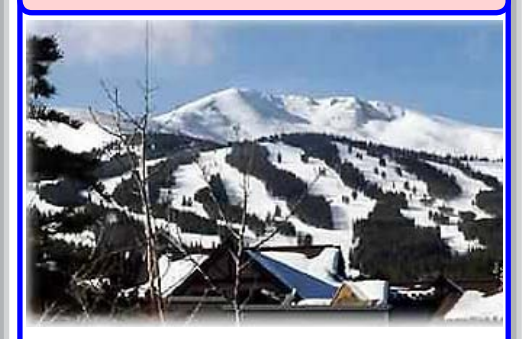
Jan. 28 - Feb. 4, 2017

The Far West ski week will be in Breckenridge, CO.