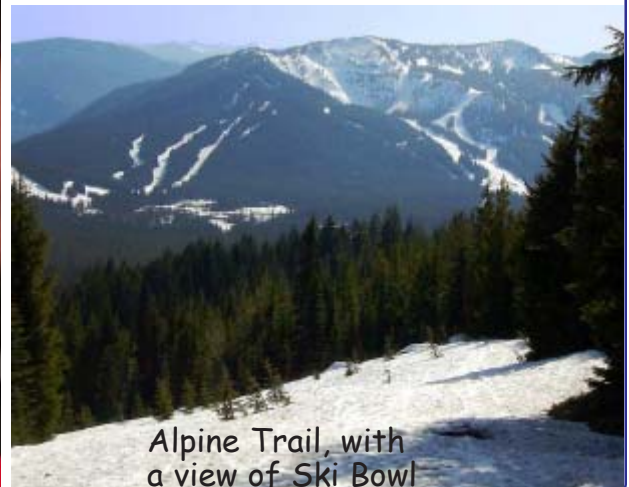
Alpine Trail, with a view of Ski Bowl