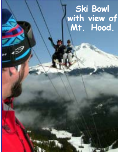
Ski Bowl with view of Mt. Hood.

I drove to Government Camp and left my car at the Summit ski area, then hitchhiked to Timberline . That's where I found the best, totally untracked snow, on skier's right of the Palmer chair. I took dozens of photos especially during a single 4,500' vertical descent, from the top of Palmer, past Stormin' Norman and then down the Alpine trail to the Summit ski area in Government Camp. What a day! Skied a total of 25,000 vertical feet. Not bad.