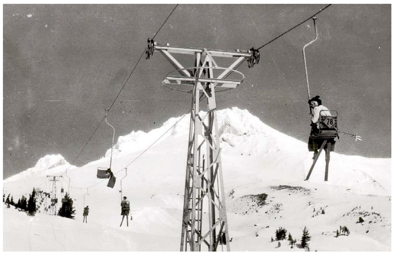
The Magic Mile, the first chairlift in Oregon in 1939, and also the longest one in the world at the time.

Today, Timberline has 4 detachable express quad chairlifts.