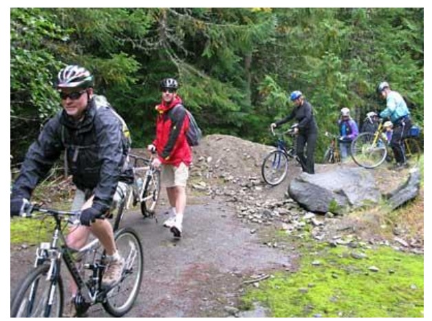
Man-made obstacle on the old road.