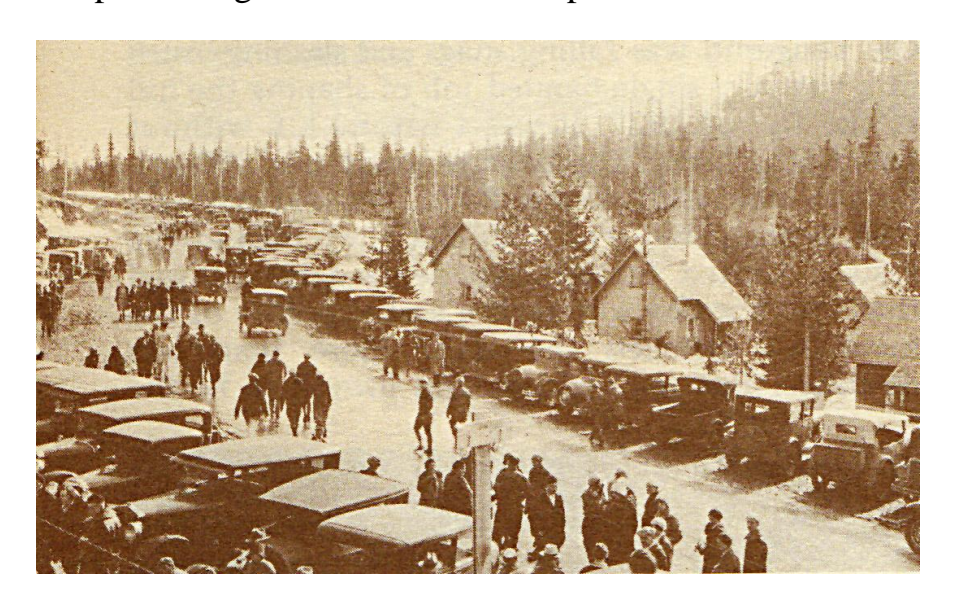
Government Camp in 1928

Bogged down by mud and snow, with half of the livestock lost or dead and soldiers near total exhaustion, Lt. David Frost abandoned 45 Cavalry wagons in October 1849, before starting down Laurel Hill. Their noted presence beside the Barlow Road became the namesake of the alpine village - Government Camp.