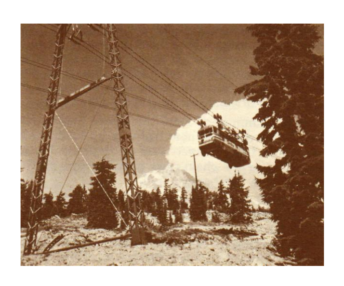
Photo from "Mt. Hood – A Complete History" by John F. Grauer, published in 1975.

In the early 50s, the Skiway aerial tram from Government Camp took skiers up to Timberline. It was actually a bus with wheels above its roof. The wheels travelled along a stationary cable. It took about 10 minutes one way! It was dismantled after a few short years, when a bus service proved faster and cheaper.