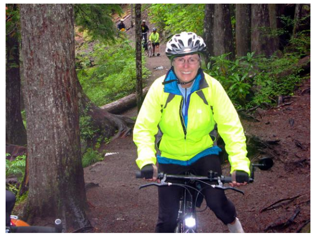
A side-trip to the Little Zig Zag waterfall. A ride down Road 35, parallel to Hwy.26.