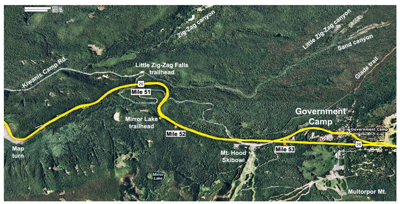
The thick yellow line is the modern Highway 26. The thinner more wiggly white line is the older highway, now abandoned.

A bicycle ride through the History of Mt. Hood