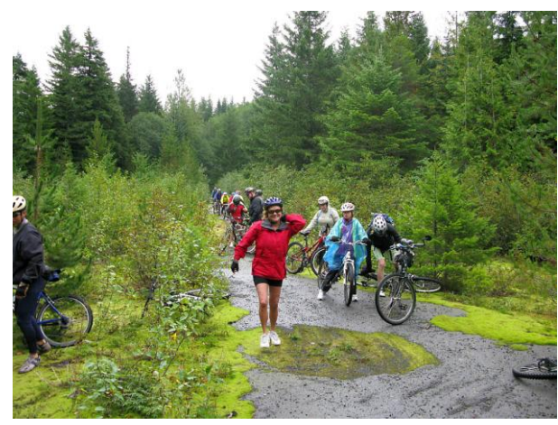
Nature closing in on the old road.