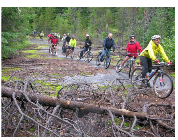
Fallen trees are obstacles on the old road