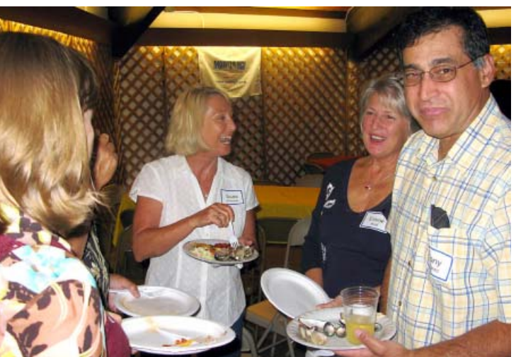
See more photos at www.mthigh.org/Photos.htm.