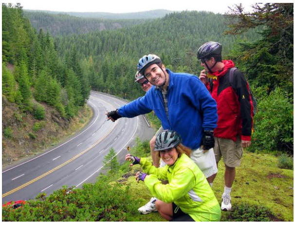
The old road is abruptly cut off here by the new Highway 26, but it continues on the opposite hill.