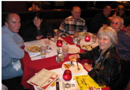
Warren Miller dinner and movie