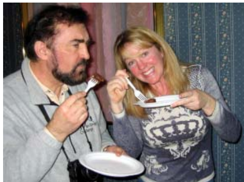
Chocolate Party contest judges

We also offer bowling, golf, biking, hiking, etc.