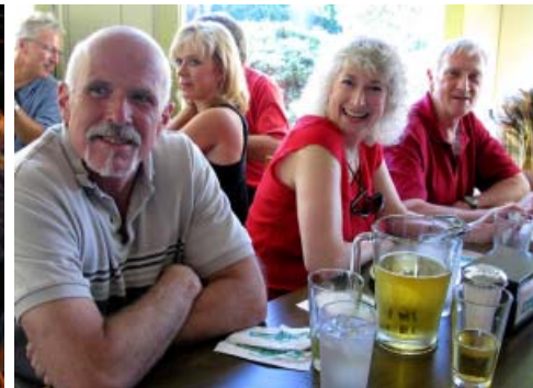
Socializing at a Pizza party