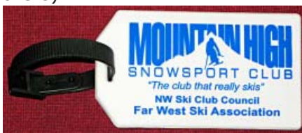
Luggage tags distributed at FWSA Convention in Bellevue.