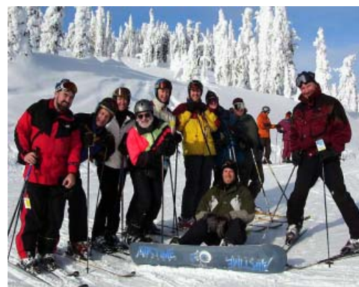
Mt. High members at Big White