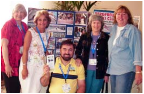
front of the Mt. High history display