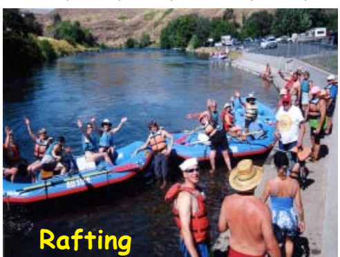
See more photos at www.mthigh.org/PhotosRecent.htm.